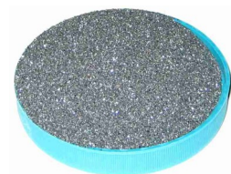
Grits & Polishes

Johnson Brothers Lapidary - 714-771-7007 - www.JBFC.com