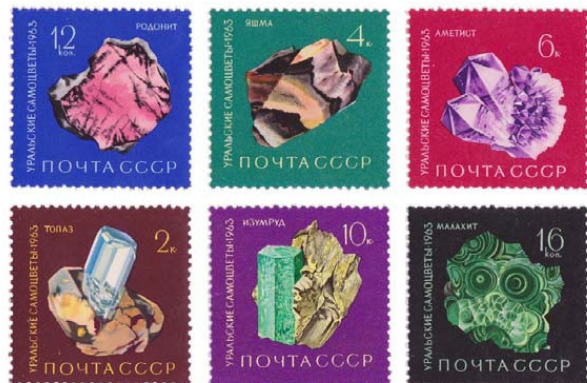
Russian mineral stamps 1963

Mineral stamps from the former Soviet Union. Pictured from left to right, top to bottom are Rhodonite, Jasper, Amethyst, Topaz, Emerald, Malachite.