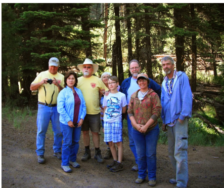
THE CREW AT DAVIS CREEK