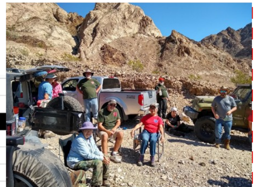
Anaheim Searchers 2019-2020 Field Trip Schedule

and campfire and on Sunday, after a blustery night, we tried another spot for those pesky garnets, this time with some success! The climate, the views and the experience of being outdoors is almost as wonderful as finding special material that's thousands – if not millions – of years old. We broke camp after lunch and left for home.